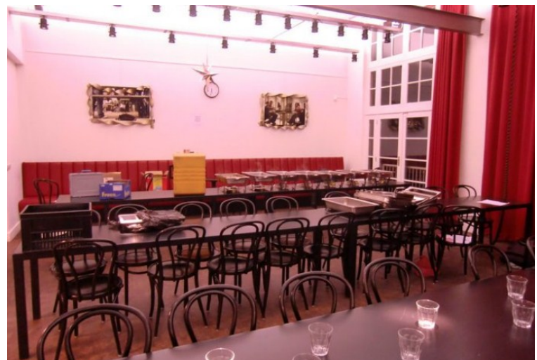
Photos of Soviet Heritage, Solace, Debating and Winter Dinner.