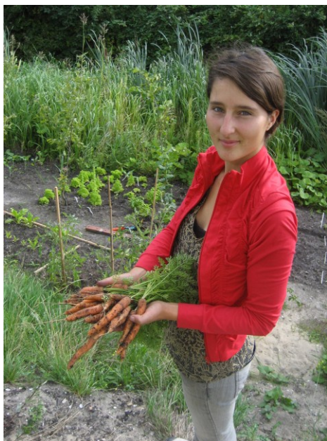
Photos of the UC-tournament, the AIMUN (board and CUIMUN delegation), gardening and Dicta (AUCDT).